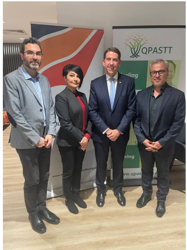
QLD Government Treasurer, Hon. Cameron Dick & ISQLD Management Committee

I would like to thank our funding partners and sponsors for their contribution and support during the year. Without their financial support, ISQLD could not make great things happen in our society.