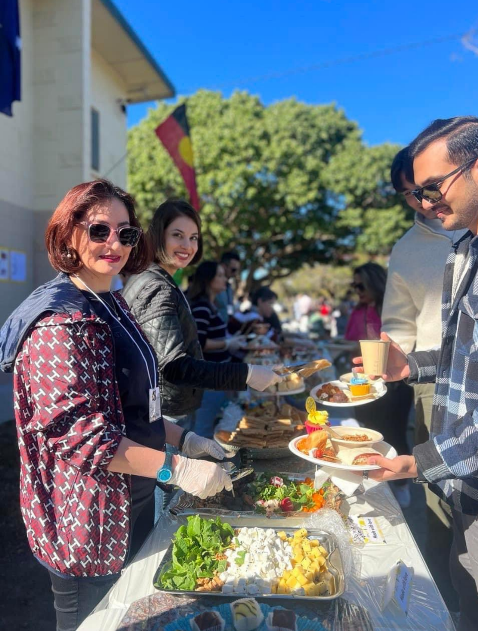
ISQLD 1ST AUSTRALIA'S BIGGEST MORNING TEA | AUG 2023