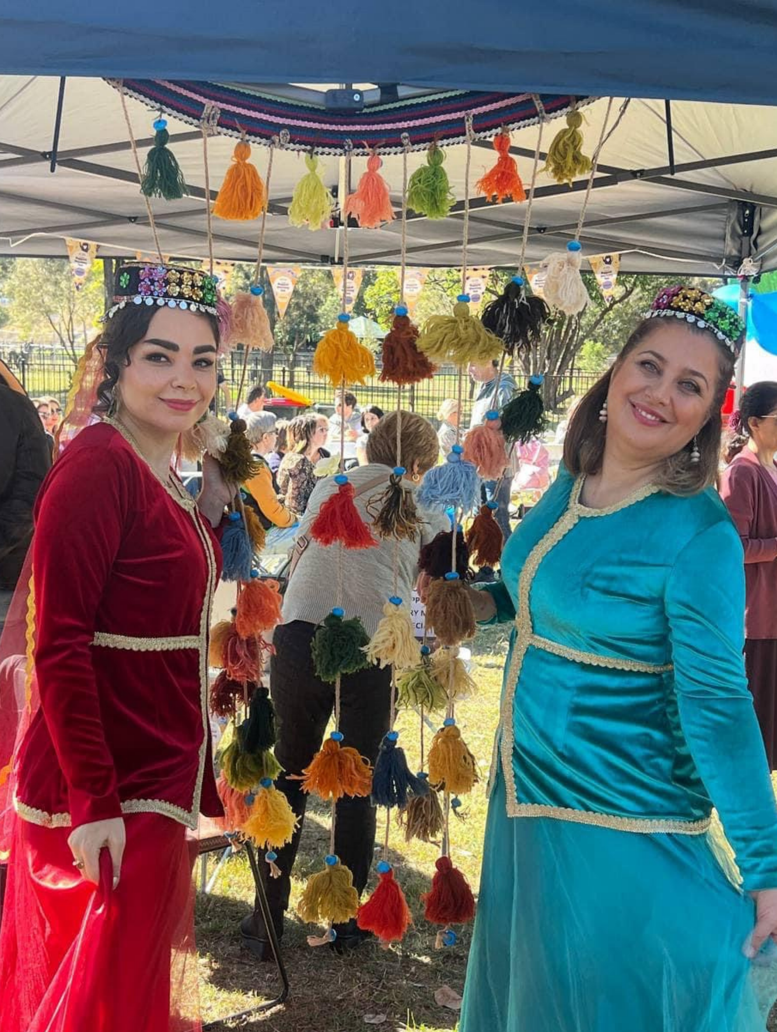
ISQLD PERSIAN BOOK EXHIBITION | AUG 2023